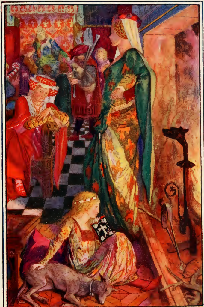
·ISABEL· "in the dark evenings"